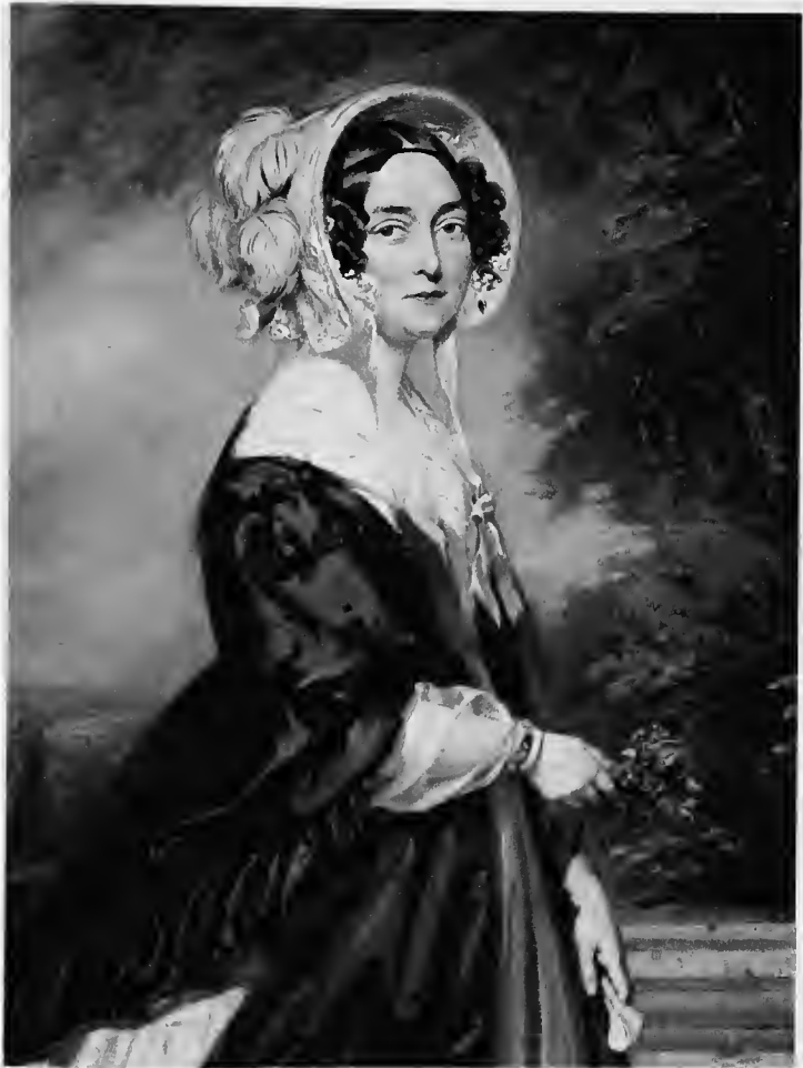
H. R. H. The Duchess of Kent 1841